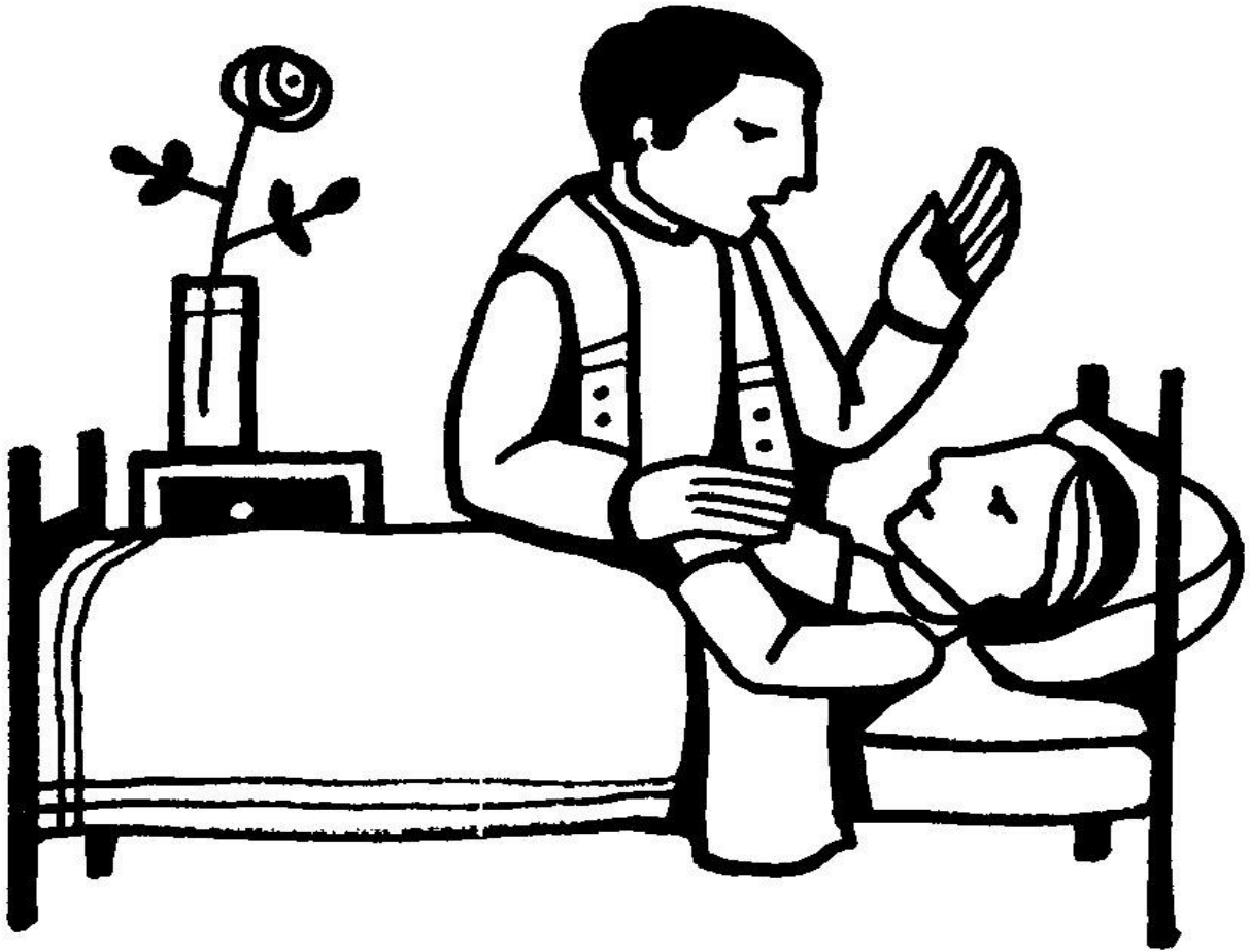
Anointing of the sick